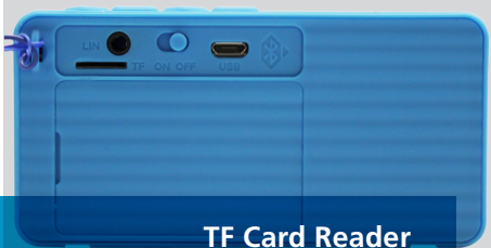
TF Card Reader