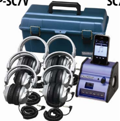
Sound Vision Video Listening Center LCP/MV8920/HA5