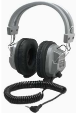
Personal Headphone HA2