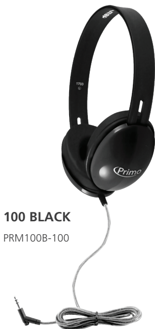
100 BLACK PRM100B-100