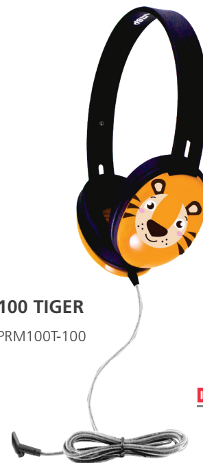
100 TIGER PRM100T-100