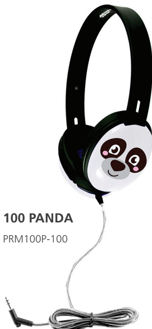
100 PANDA PRM100P-100